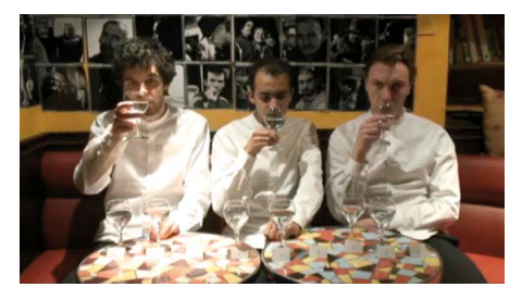
Jury prize "Les goûteurs" (The tasters) Eau de Paris