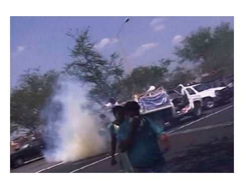
Bronze Drop – INBO Prize "13 villages defending earth, air and water" Francesco Taboada Mexico (2007) 60 min