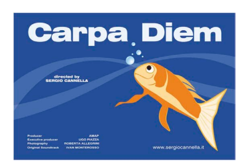
Bronze Drop International Office of Water "Carpa Diem" Sergio Cannella Italy (2006) 2 min