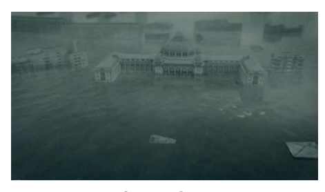
Ouranos Prize "Climate change" "Het verloren land" Jos de Putter Netherlands (2007) 55 min