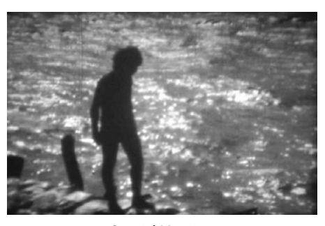
Special Mention "Una mancha en el agua" Pablo Romano Argentina (2006) 20 min