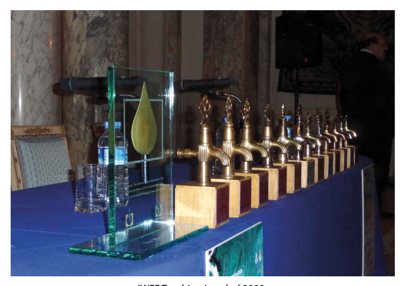
IWFE Trophies, Istanbul 2009.

One of the most recent events, the Paris Water and Film Events held from 18-25 March 2010 at the Water Pavilion in partnership with Eau de Paris, screened 43 films with preview screenings, conference-debates with the public and a VidéEau competition run in partnership with Dailymotion: 75 films on the theme of "Water and Paris". A 2<sup>nd</sup> edition will take place from 18 to 22 March 2011.